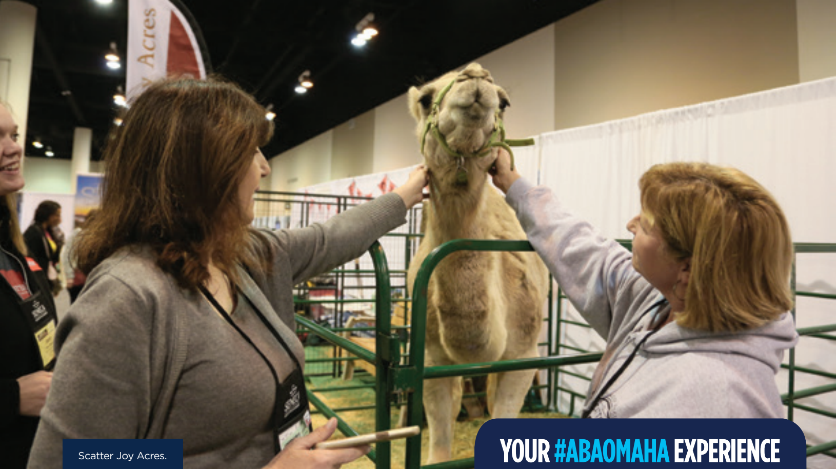
Scatter Joy Acres.